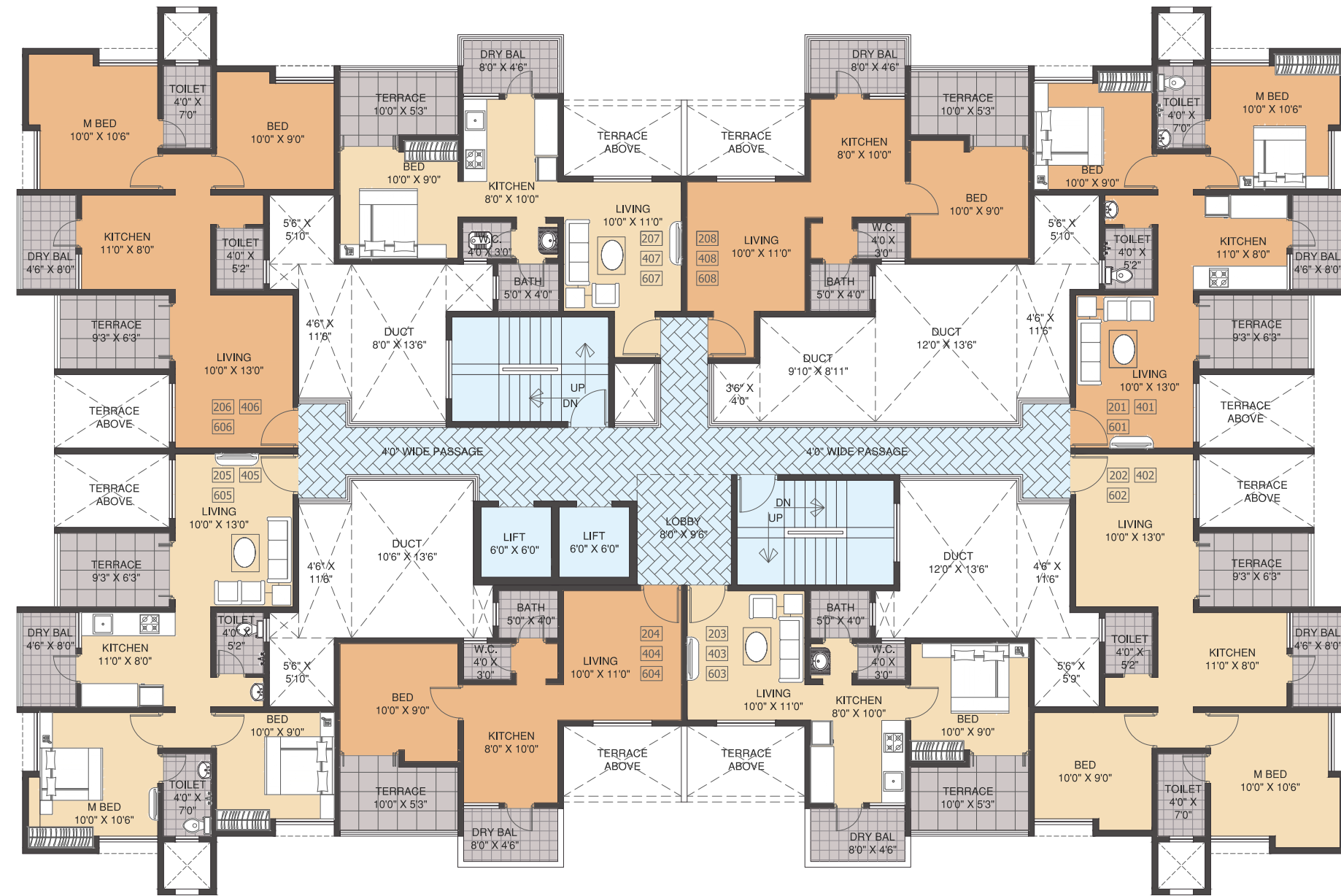
(Bldg. A, B, C) TYPICAL 2ND, 4TH, 6TH FLOOR PLAN