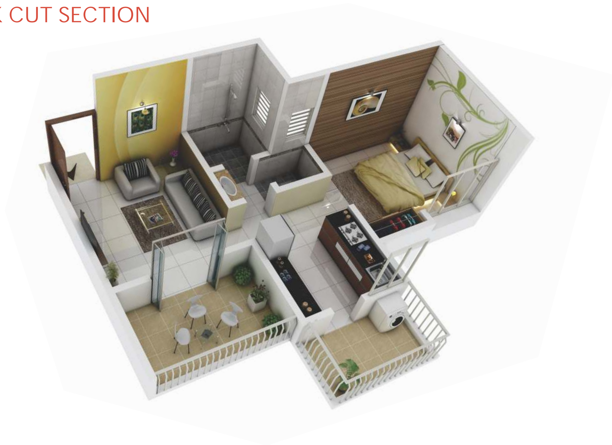
1 BHK CUT SECTION